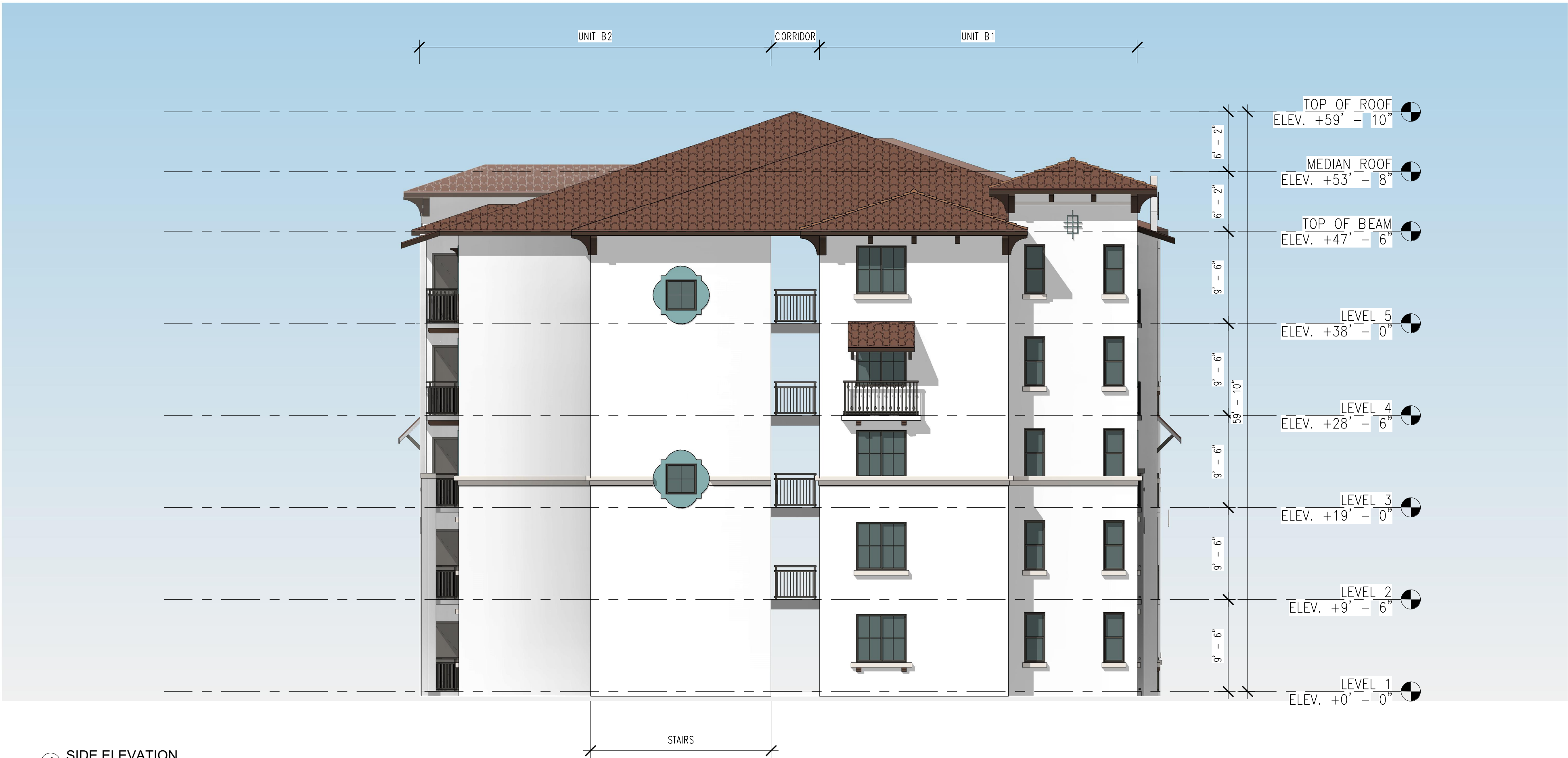
4 SIDE ELEVATION 1/8" = 1'-0"