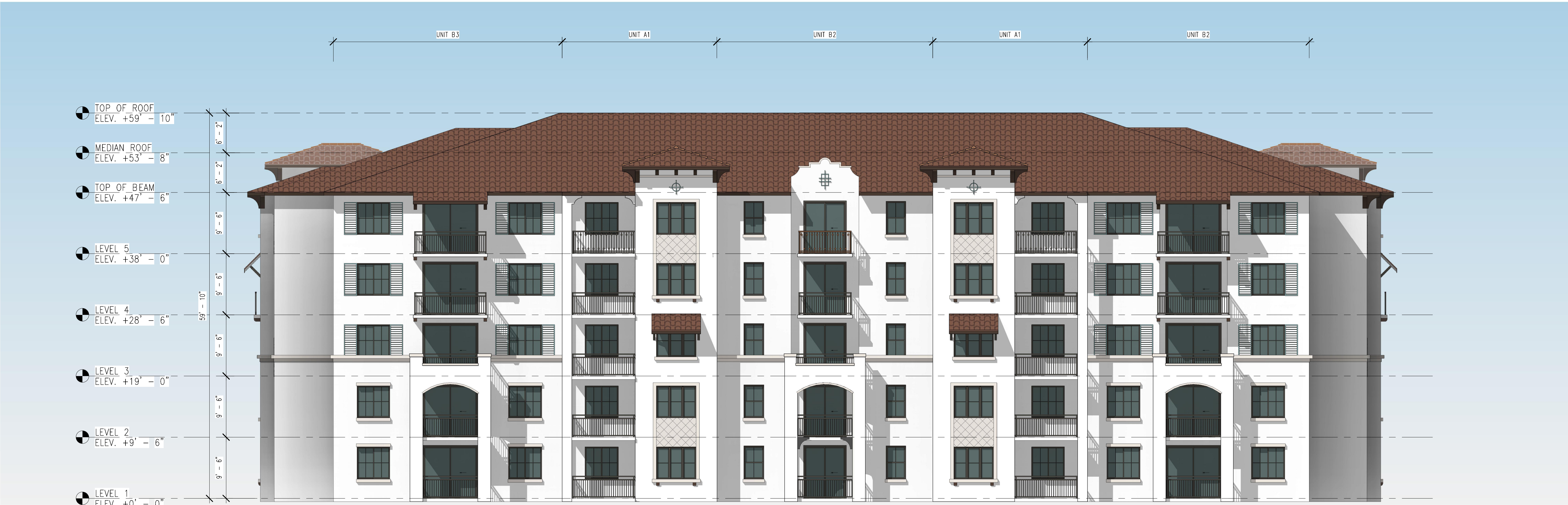
2 BACK ELEVATION 1/8" = 1'-0"